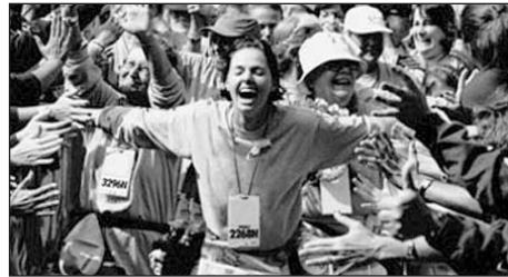
Thousands of women and men will unite to fight breast cancer this September.